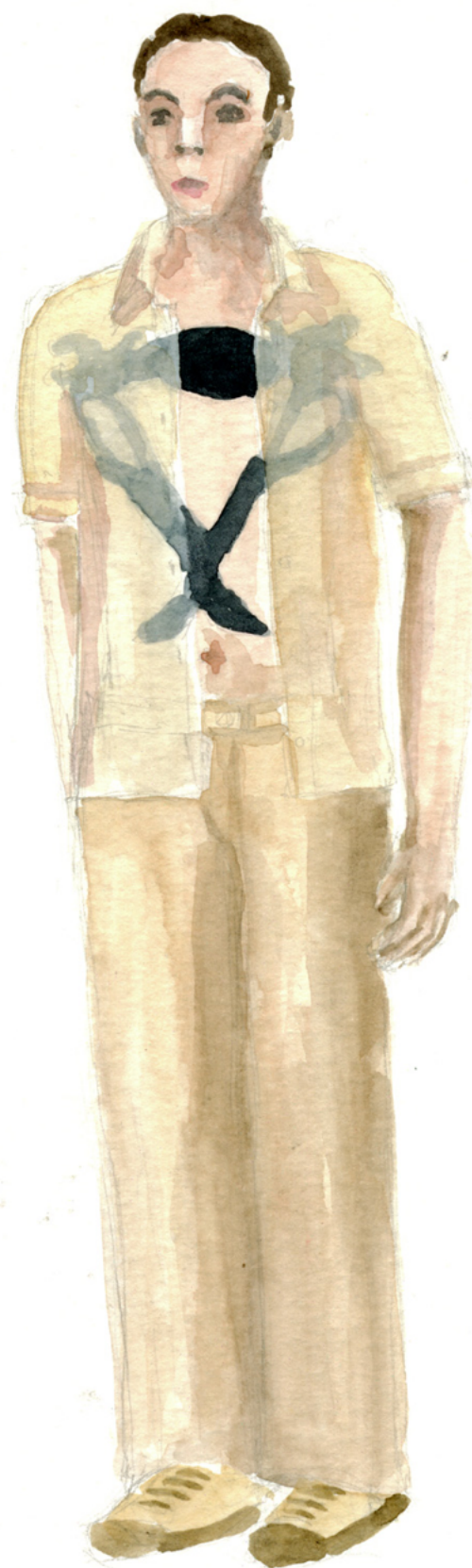
Crave, 5e élément